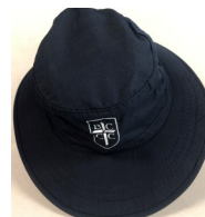
Year 7 to 12

Hat policy - from 1 September to 30 April all students must wear their school hat while outdoors.